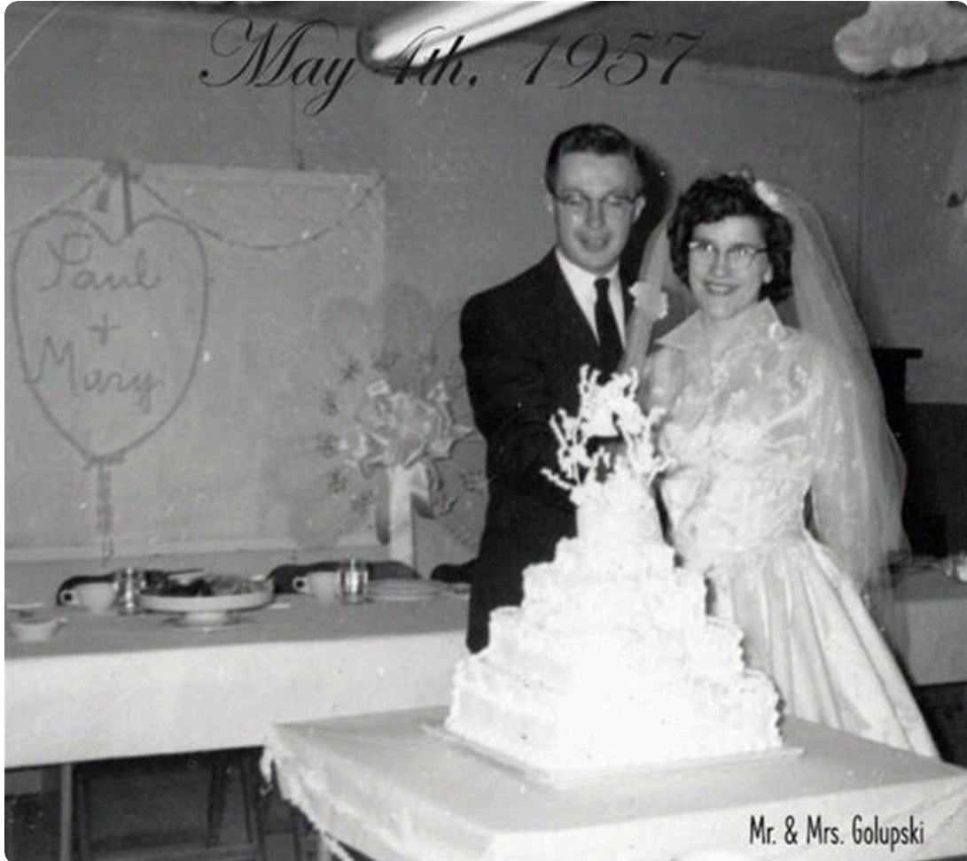
May 4th, 1957